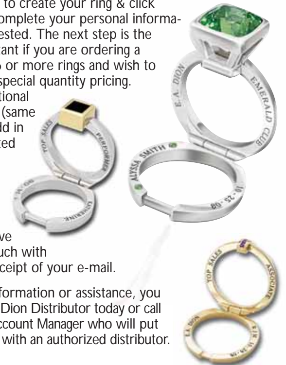
Each Treasure Ring® is protected by U. S. Design and Utility Patents 5,669,241 D392.585 and Canadian patent #2,249,623

For more information or assistance, you can call your Dion Distributor today or call your Dion Account Manager who will put you in touch with an authorized distributor.